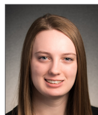
Brooklyn Pillar Electrical.