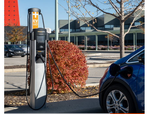
RLG installed electric vehicle chargers at Owens Corning.

Making the choice to work together and be the person others can count on to accomplish something even greater than what could be achieved working independently.