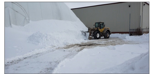
Doug Kadlick clears the deep snow at Total Sports

Commit to success of others - the Building Success Together Roadmap