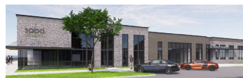
A rendering of Chappel Place