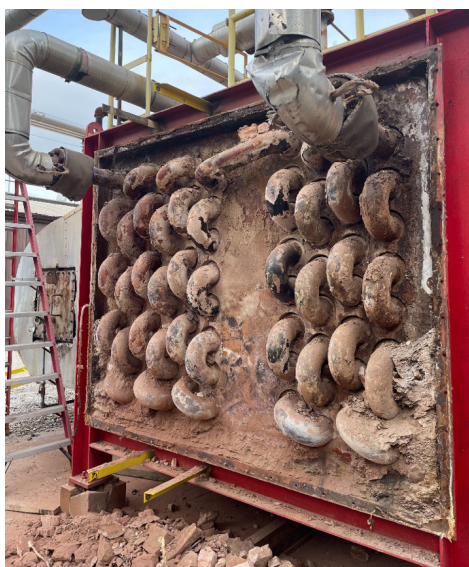
The old asphalt piping system at Owens Corning's Medina location.