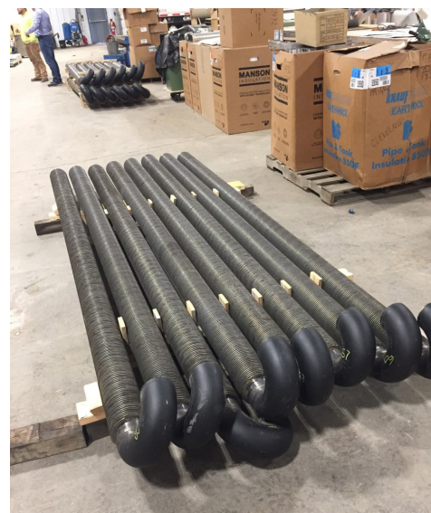
New piping installed by GEM associates at RLG's NE Ohio office for Owens Corning Medina.