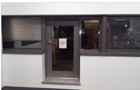
Owens Corning's new door makes maintenance safer.