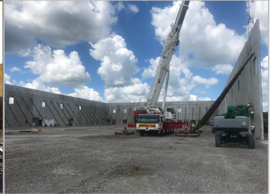
At left, RLI cement finishers place concrete at the new Amazon project. At right, GEM ironworkers erect precast panels.