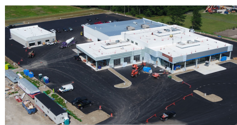
Yark's new Chevy dealership.