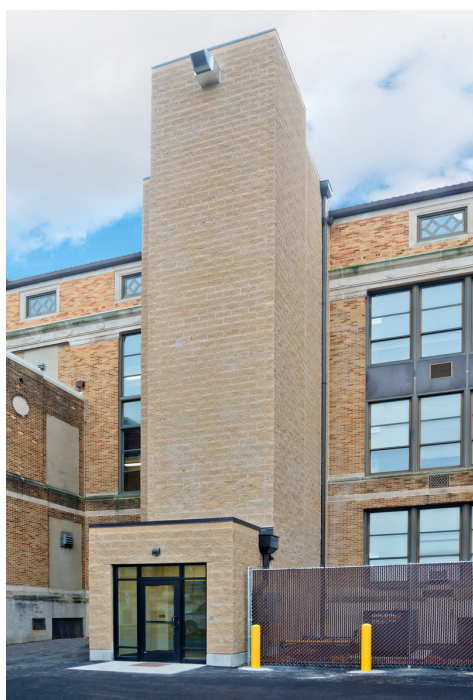
The new elevator at Central Catholic High School

AAA Allied Group Inc The Ability Center of Greater Toledo Capstone on Campus Case Western Reserve (16 locations) Do It Best Corp. Etkin Management LLC Filling Memorial Home of Mercy (two locations) GROB Systems Inc. Harbor Behavioral Health (two locations) Hotel at Oberlin Hylant Cleveland Jones Hamilton Company Kawasaki Robotics USA, Inc. Matheson Tri-Gas (three locations) Optima Management Group Total Sports Complex Tri County Tarp LLC WF Whelan Zoar Lutheran Church