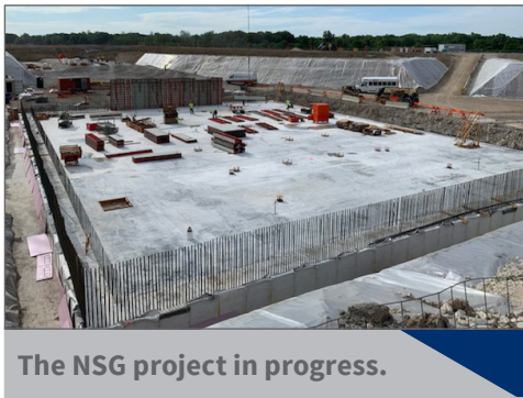
The NSG project in progress.