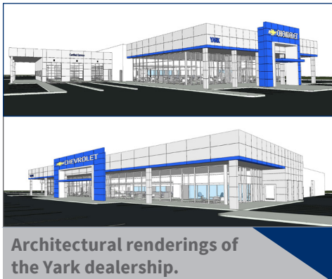
Architectural renderings of the Yark dealership.

RLI will support scaffold needs for mechanical, electrical and instrumenta-