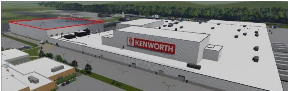
The Kenworth campus with the paint shop roof outlined in red.

Kenworth Paint Shop, Rescue Misson masonry and Tuffy Associates RTUs