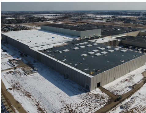
Walgreens distribution center expansion