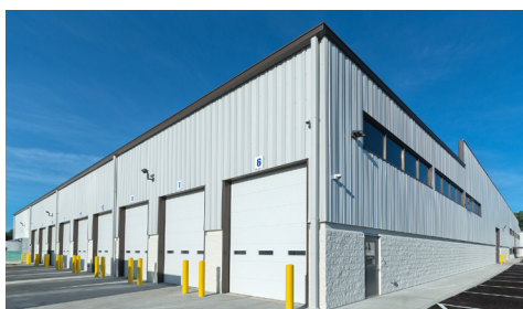
Cutting Edge's facility expansion will make room for 40 new jobs and double the company's output.

Perrysburg - The new 71,400-square-foot Varco Pruden pre-engineered building addition is complete. RLI was the design/build contractor and self-performed concrete, masonry, carpentry and site work. The expansion added a two-story office with high-end finishes, and manufacturing, shipping and receiving areas. Work began in September 2017.