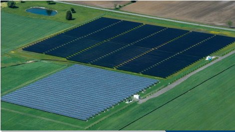
ONU's phase II solar array was completed in April 2018.