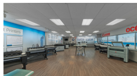
Eastern Engineering's new demonstration room shows off CAD and printing capabilities.

Toledo - Work is complete on the 20,000-square-foot renovation for Hart, Inc. in the Hylant Building. RLI served as the construction manager and general contractor and GEM performed mechanical, electrical, plumbing and structural steel.