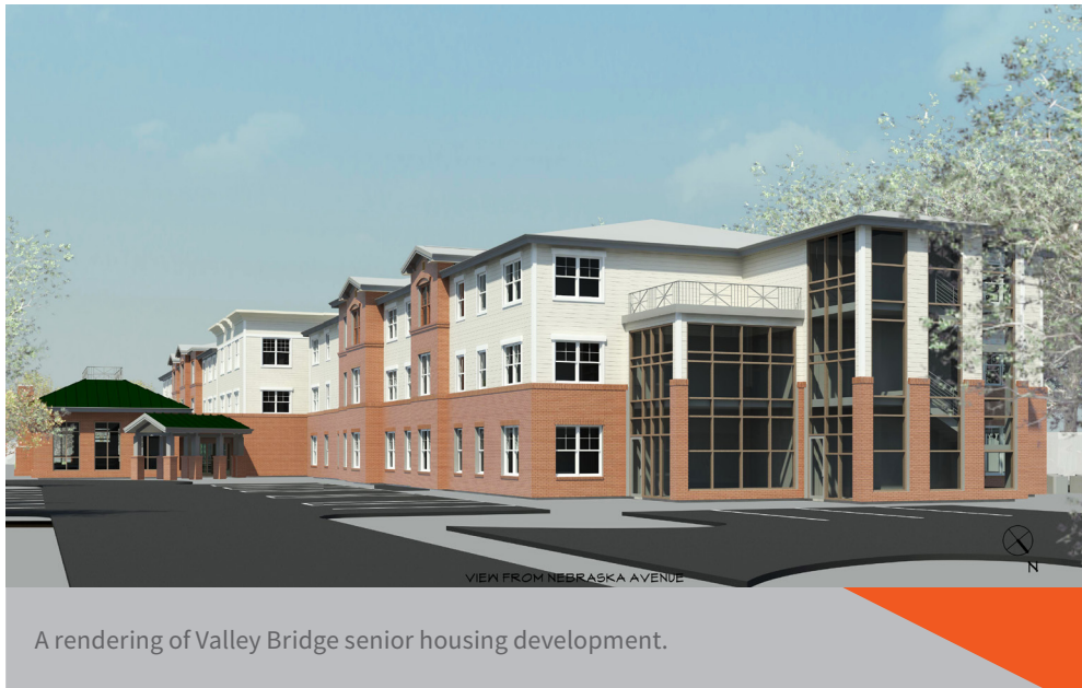
A rendering of Valley Bridge senior housing development.