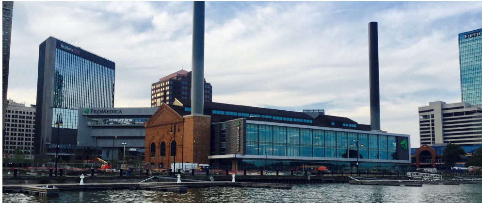
A view of the steam plant and junction building from the Maumee River.