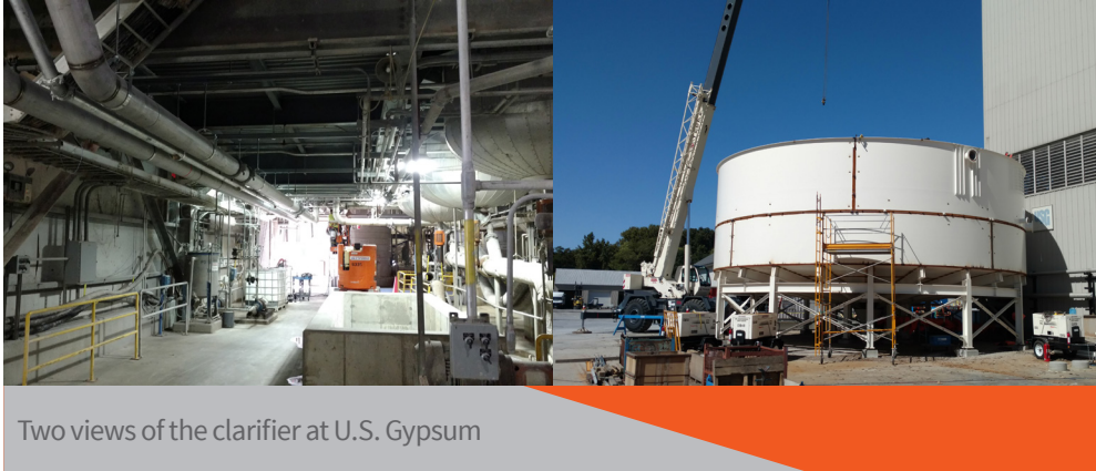
Two views of the clarifier at U.S. Gypsum