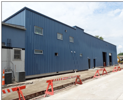
The Hoover Wells office building and warehouse