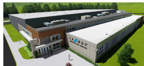
An architectural rendering of the La-Z-Boy Innovation Center.

Penske, Avon Lake - RLI and GEM are building a new locker room, restroom and installing