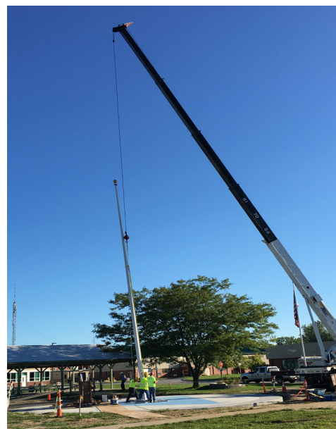
RLI's Special Accounts team erects the flagpole at the 911 Memorial at the Ohio Air National Guard 180th Fighter Wing.

RLI is partnering members of TRACE - Toledo Regional Architects, Contractors & Engineers to build the memorial.