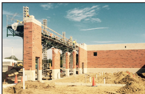
RLG project update: Masonry rises at AAA's new location in west Toledo.