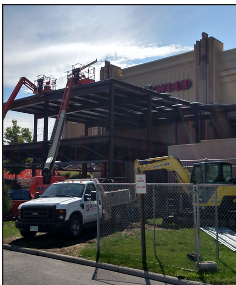
Roof deck installation on the Hollywood Casino Toledo's new deck addition.