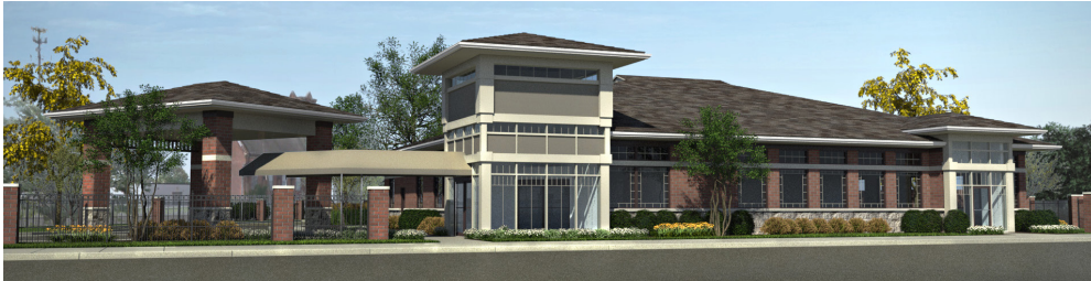
A rendering of the Fresenius Medical Care dialysis center under construction by RLI and GEM near downtown Toledo