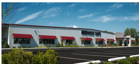
Midwest Tape in Holland